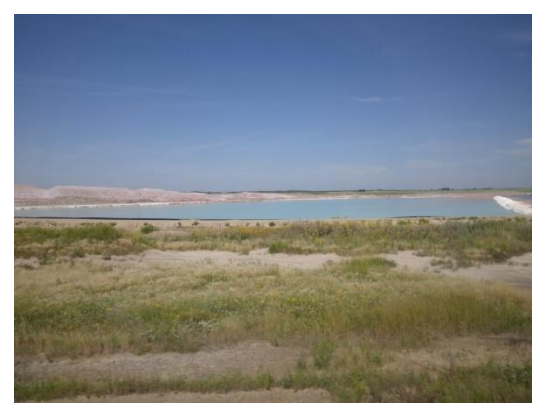
Solution pond PotashCorp Patience Lake